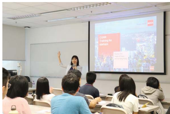
Pi Centre regularly invites experts from various fields to speak on their expertise, and to equip our budding entrepreneurs with business skill sets

China Morning Post (SCMP) and Hong Kong and Shanghai Banking Corporation Ltd. (HSBC). We have gained a reputation in the community and gradually inspired the formation of a start-up community within CUHK.