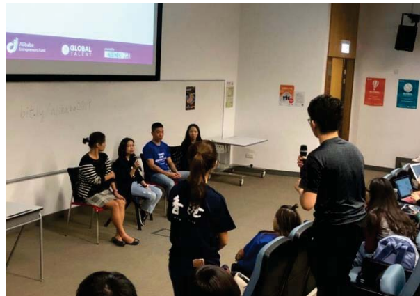
EPIN introduced its newly-launched Internship Programme, offering hands-on experience in an entrepreneurial and innovative working environment to EPIN students