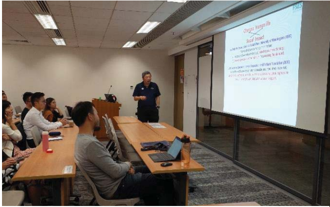
Social Impact Assessment Workshop

Universities are increasingly held accountable for ensuring that their projects deliver targeted impacts effectively. Social Impact Assessment as an evidence-providing tool to measure tangible benefits has grown into an encouraged practice. However, there are currently no established standards to validate the outcomes of small scale projects, and research staff are often unsure how to adequately measure their social impact other than stating their outputs. The resultant difficulties in