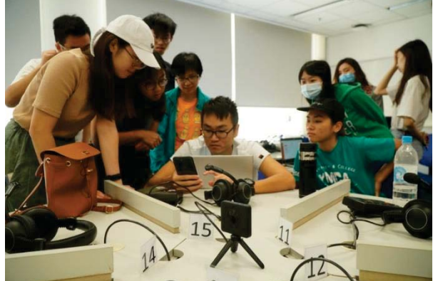
While students often lacked the necessary techniques and skills on digital output and 3D design, a Marker Workshop Series was introduced to cater their needs.

Below is the list of Maker Workshop Series: