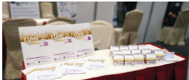
Exhibition booth by our KL Team during the Redefining Early Stage Investments Conference in Taipei

Apart from insights gained regarding the latest development and market / investment trend in biomedicine and related start-ups, investment interests with different investors were also noted in said events