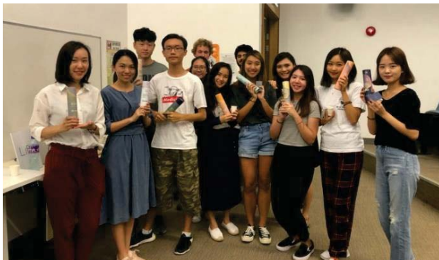
Entrepreneurs from different industries were invited to share their real-life entrepreneurial stories in EPIN1010

EPIN1010 Anatomy of an Entrepreneur and EPIN1020 Design Thinking and Practice are part of the fundamental and founding courses in EPIN curriculum, proven to be higher popular among students.