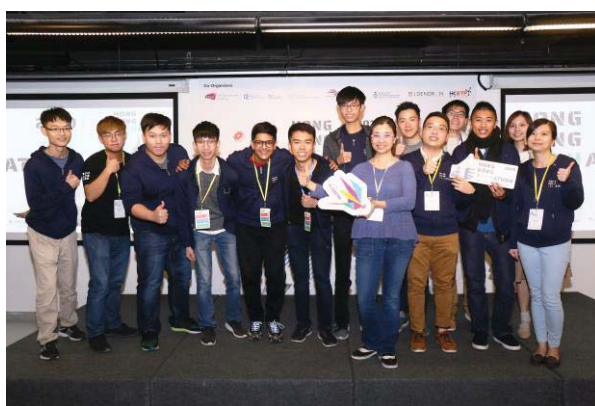
CUHK student team at Hong Kong Techathon 2020, an event converging the entrepreneurial spirit and bright ideas of local university students

In addition to the Technology Support Scheme for Universities (TSSSU) offered by the Innovation and Technology Commission (ITC) for staff and students, we also support student-initiated startup projects, which we call Pre-Incubation teams (Pi teams). These two programmes have attracted steady interest since their introduction in 2014, with a total of 181 TSSSU and 292 Pi applications. This year, we were able to fund 20 TSSSU companies and 14 Pi-teams. To date, 16 companies (including Pi & TSSSU) have been awarded term sheets, with a total amount close to HK$620 million.