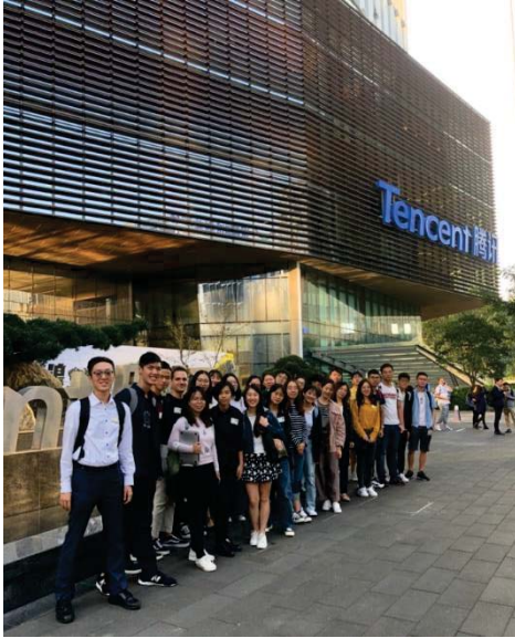
Tencent visit 2019

CUHK students were invited to join “Hong Kong Fintech Week 2019 – Shenzhen Day” – Tencent Visit, organized by Tencent Hong Kong via EPIN. The event aims to provide an opportunity for the students to get to know Tencent and its development in financial services. In addition to the Keynote Speech and Individual Group Sharing by Tencent FiT, students were also given the opportunity to join a panel discussion on “Ethics in Data-Driven Economy”. Representatives from the government, regulator, industry and academia were invited to share their experiences and insights.