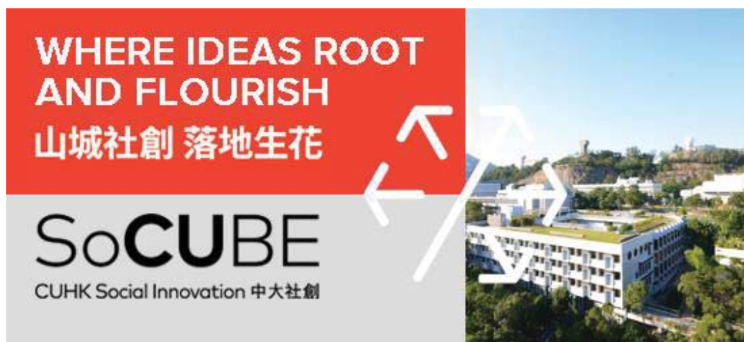
SoCUBE incubates social innovation ideas and endeavours from members of CUHK

Since its launch in October 2019, the SoCUBE website ( socube.cuhk.edu.hk ) has been viewed by 10,000 users and garnered 35,000 page views. In particular, the site houses rewritten profiles for our professors' recent projects in layman's terms and a problem-solution-impact structure, with specific emphasis on communicating impact. This provides a better picture of what our faculty members are working on and what they intend to achieve, which may open up for them opportunities in collaboration, funding and investment.