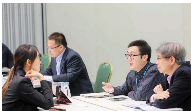
One-on-one partnering meetings with investors / industrial partners by our KL Team and VA Team during the Redefining Early Stage Investments Conference in Taipei

Aligning with the HKSAR Government's efforts to support the innovation and technology industry, CUHK aspires to position itself as the most innovative local university. Delegates from ORKTS attended various local industrial conferences during the report period to showcase technology, network, and explore collaboration opportunities, including the Business of Intellectual Property Asia Forum, the A.I.R. Week cum Grand Opening of AI Plug & RCC2.0, and The Connected Cities (Virtual) Conference.