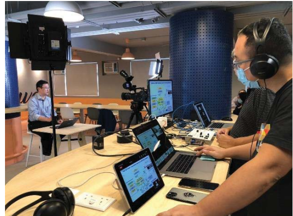
InnoPort sets to host various events on innovation and entrepreneurship, such as webinars and live chat sessions